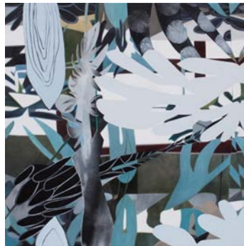
Victory Garden, 2017, 90,5 x 91 cm, AaL