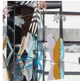
Studio Garden, 2017, 91 x 91 cm, AaL

The result is impressive. In each painting we enter a different world: a jungle with colorful, strong and animal-like vine or a place with delicate leaves and flowers reminiscent of a Japanese garden. A multitude of different layers invite us to look more closely, to see what may be hiding behind the next corner.