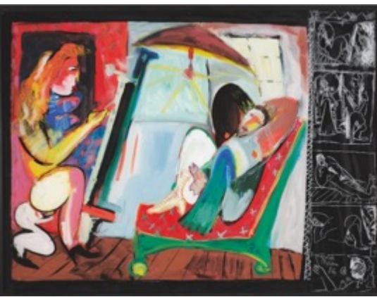
Natascha Mann, Painter and Model, 1986, Etching (2/9), Paintress and Model, 1986, Acrylic behind Glass

viewer. A sensual pleasure beyond feminist dogmas.