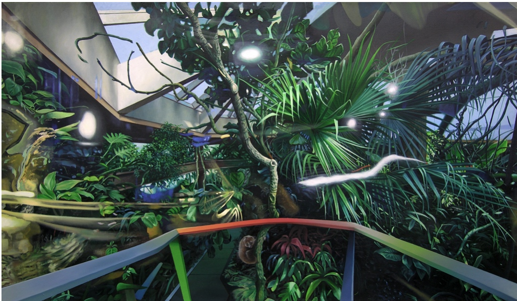
Paradise Not Lost, 2020, Oil on Linen, 95 x 165 cm

Opening 29.4. 21 from 18 – 21 pm | 30.4.21 from 11 – 19 h | 01.5. – 2.05.21 from 12 - 20 h