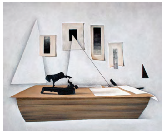
Revolution, 2015, oil on canvas, 50 x 60 cm

Duration of the exhibition: 02.09.22 - 24.09.22