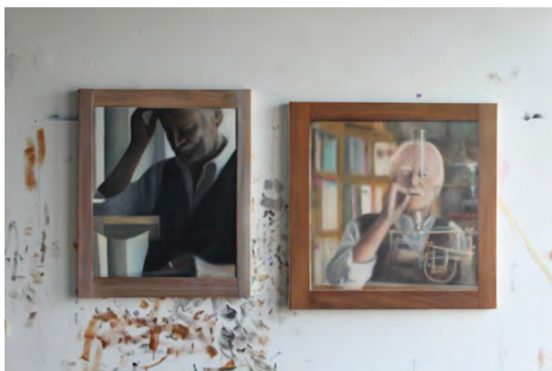
Portrait I and II, 2015, oil on canvas, 49 x 49 cm