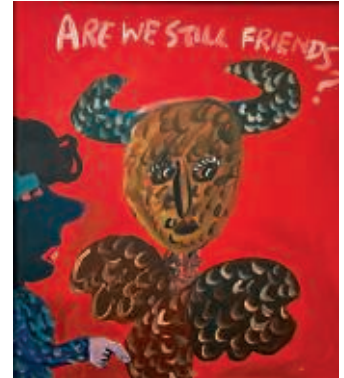
Are We Still Friends?, 1994, Acryl auf Holz, 74,5 x 64,5 cm