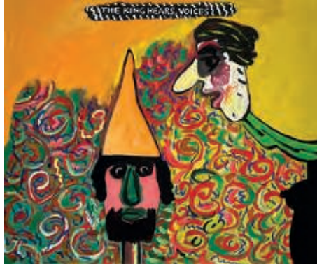
The King Hears Voices, 1993, Acryl auf Holz, 50,5 x 60,5 cm