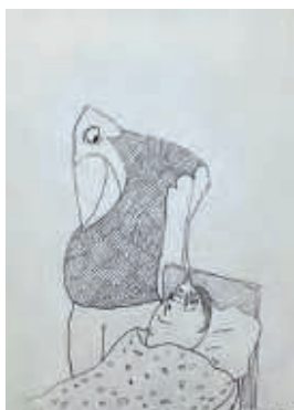
o.T., 1997, drawing on paper, framed 42,5 x 32,5 cm