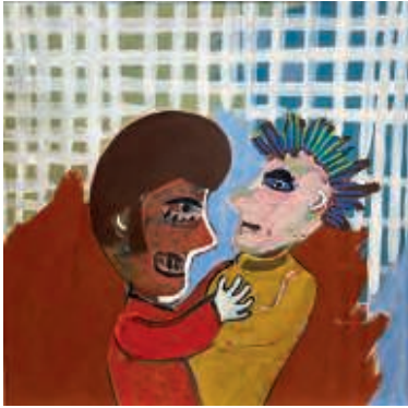
The Fight, 1991, Acryl auf Holz, 54,5 x 54,5 cm