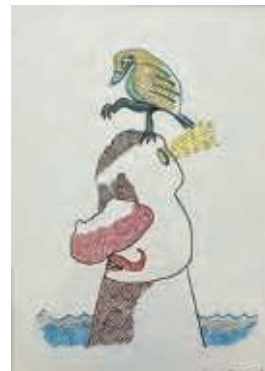
o.T., 1995, drawing on paper, framed, 42,5 x 32,5 cm