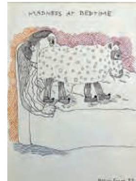
Madness At Bedtime, 1997, drawing in paper, framed, 42,5 x 32,5 cm

Duration of the exhibition: 30.09. - 29.10.22