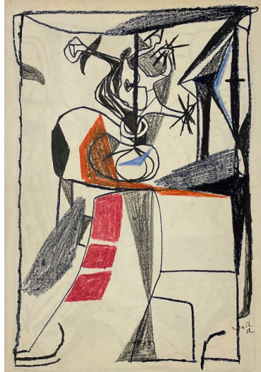
O.T., 1952, wax crayon on paper, 61 x 43 cm

Ernst Weil, who is currently being honored by the large retrospective exhibition "Spontaneous and Constructive" in the Museum Giersch in his hometown of Frankfurt, not only created expressive oil paintings, but also beautiful drawings throughout all of his creative periods, some as studies for his paintings. The Museum exhibition is well worth seeing (see article in the German newspaper FAZ). We are showing a fine selection of his idiosyncratic, humorous and poetic still lifes from his early Munich period in the 1950s as well as the energetic figurative boxer drawings of his Paris period in the late fifties and early sixties.