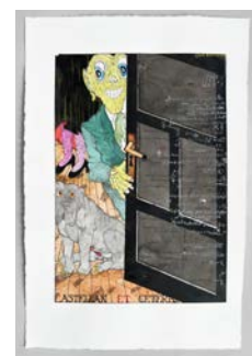
Der Castellan (Das öde Haus)

Duration of the exhibition: 6.12. – 22.12.2024