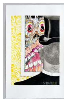
Spiegelbild (Das öde Haus)