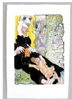
Clara strickt (Der Sandmann)